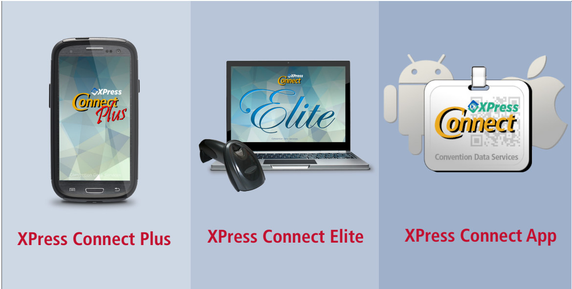
XPress Connect Plus